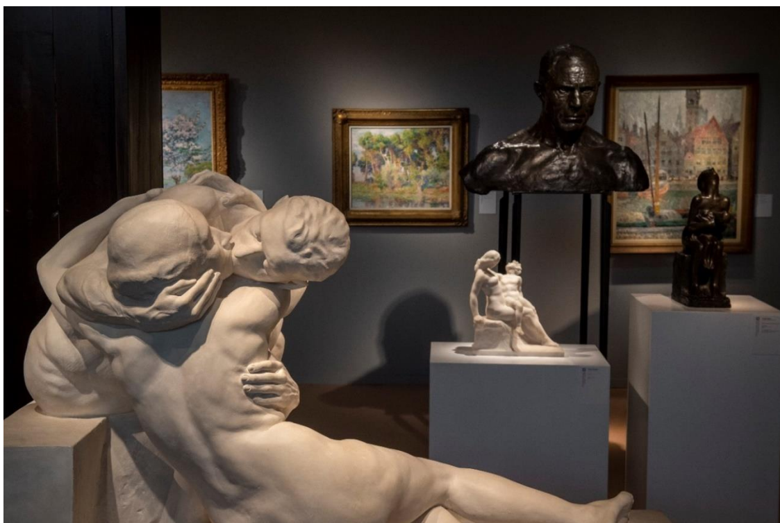
BRAFA Art Fair 2022 - Francis Maere Fine Arts