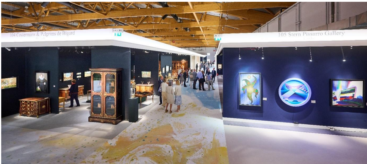
BRAFA Art Fair 2022 - View of the Fair

BRAFA 2023: BRAFA is returning to its January dates in the calendar of international art fairs