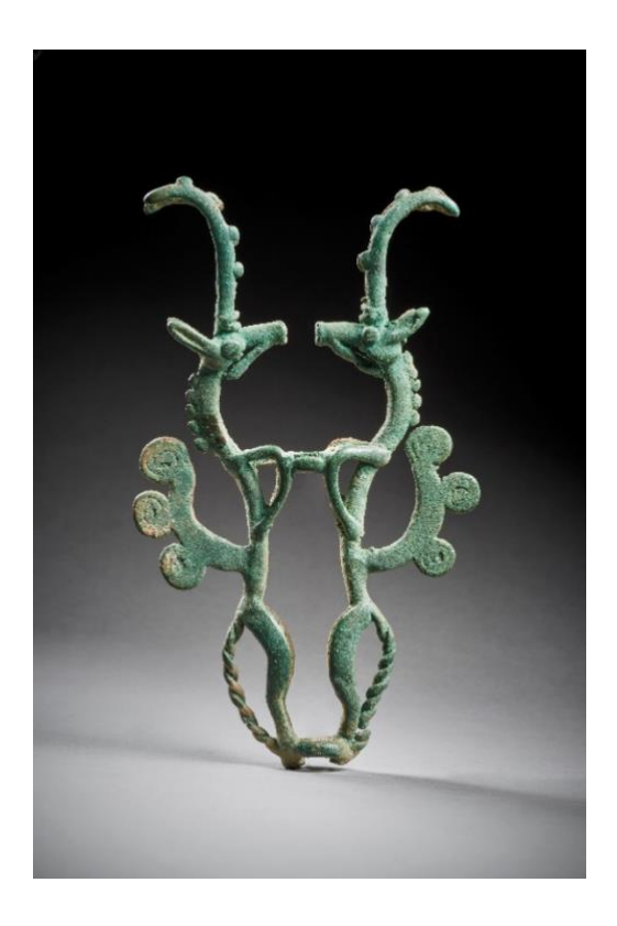
Bronze standard, Western Iran, Luristan, Iron Age II, beginning of the 1st millennium BC.

The Galerie Kevorkian, specialised in the arts of the Ancient East and Islamic Civilization, proposes "a standard" representing two winged ibex standing on either side of two horizontal rings through which a bronze rod or pin was placed to hold them on a stand. It is one of the most characteristic forms of Luristan art; the work of a civilization of nomadic horsemen and bronzesmiths established in the region – the Zagros mountains in Western Iran.